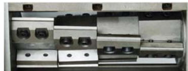
Staggered cutting Blade design