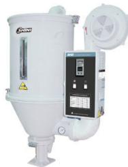
Hot Air Dryers