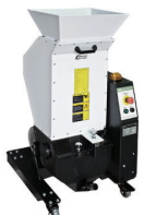
Top Feed Granulators