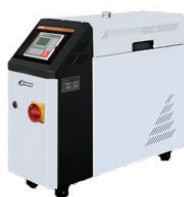
Temperature Control Units