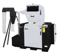
Front Feed Granulators