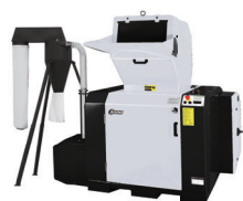
Front Feed Granulators