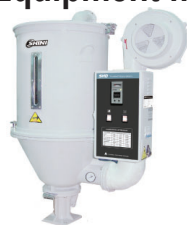
Hot Air Dryers